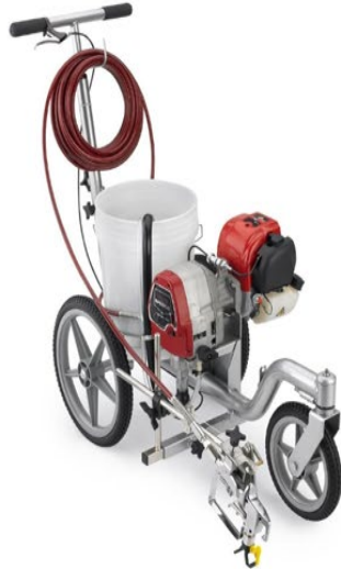
Roll over image to zoom in